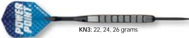
KN3: 22, 24, 26 grams