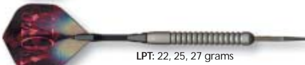
LPT: 22, 25, 27 grams