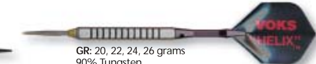
GR: 20, 22, 24, 26 grams 90% Tungsten