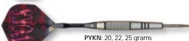
PYKN: 20, 22, 25 grams