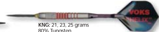
KNG: 21, 23, 25 grams 80% Tungsten