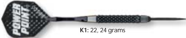
K1: 22, 24 grams