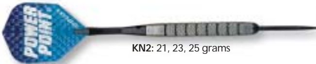
KN2: 21, 23, 25 grams