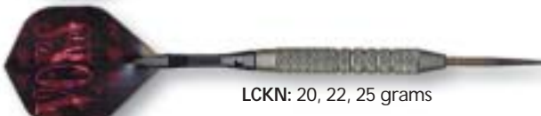
LCKN: 20, 22, 25 grams