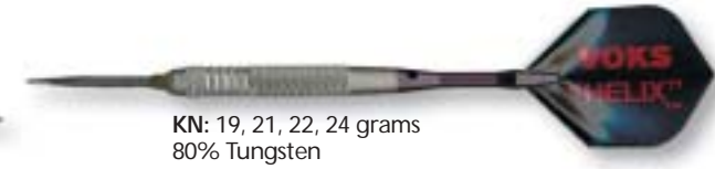
KN: 19, 21, 22, 24 grams 80% Tungsten