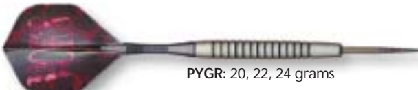
PYGR: 20, 22, 24 grams