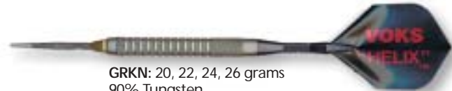
GRKN: 20, 22, 24, 26 grams 90% Tungsten