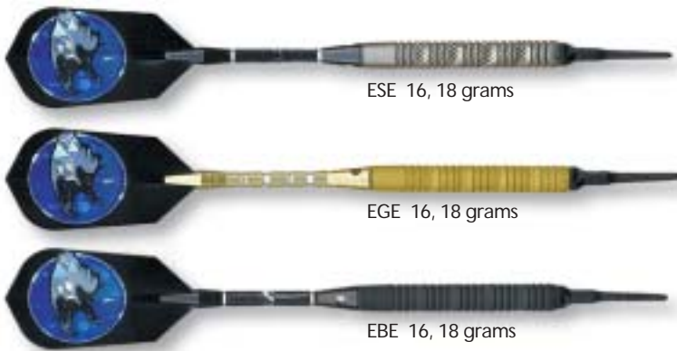
ESE 16, 18 grams