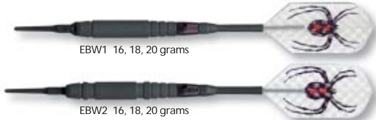
EBW1 16, 18, 20 grams