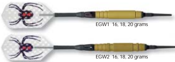
EGW1 16, 18, 20 grams