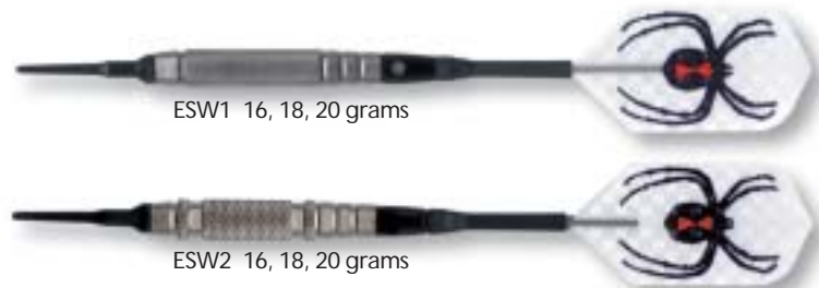
ESW1 16, 18, 20 grams