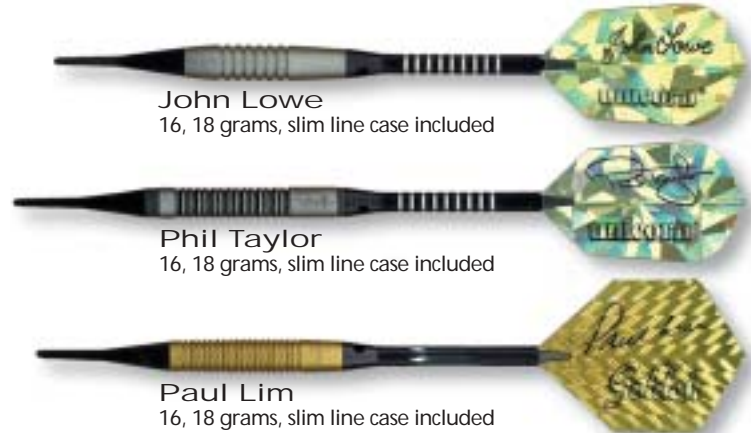
John Lowe 16, 18 grams, slim line case included